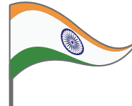
India – Indian: Hindistan – Hint