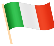
Italy – Italian: İtalya – İtalyan