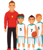
physical education: beden eğitimi