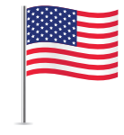
The USA – American: Amerika – Amerikan