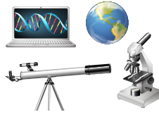
science: fen bilimleri