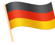
Germany – German: Almanya – Alman