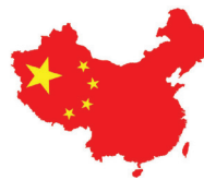
China – Chinese: Çin – Çinli