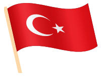
Turkey – Turkish: Türkiye – Türk