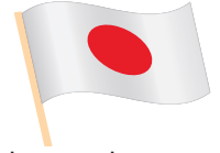
Japan – Japanese: Japonya – Japon