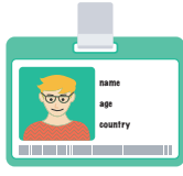
ID card: kimlik kartı