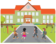
primary / elementary school: ilkokul