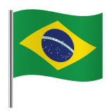
Brazil – Brazilian: Brezilya – Brezilyalı