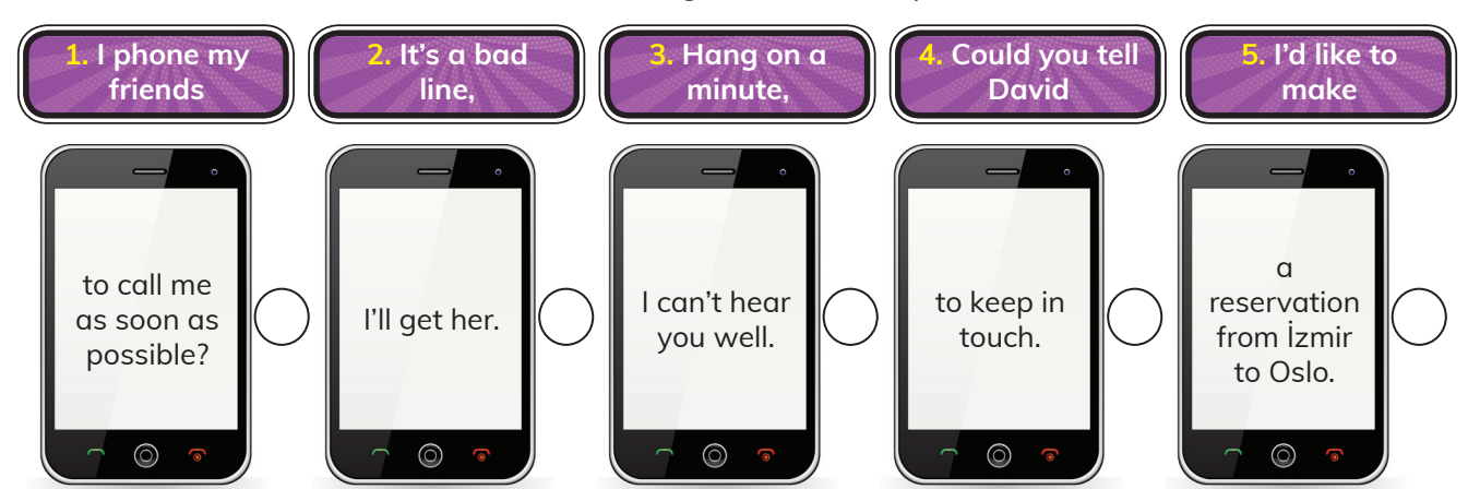
EXERCISE 4: What do you say when you don't understand? Tick the correct ones.

EXERCISE 3: Match the halves to make a meaningful sentence or question.