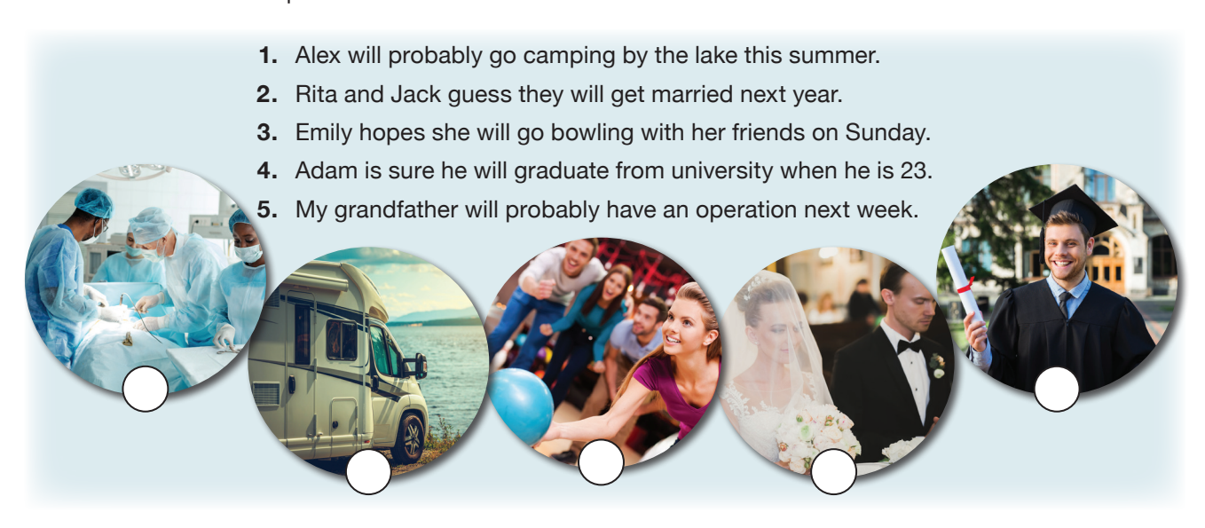
EXERCISE 4: What are these conversations about? Match them with the correct topics.