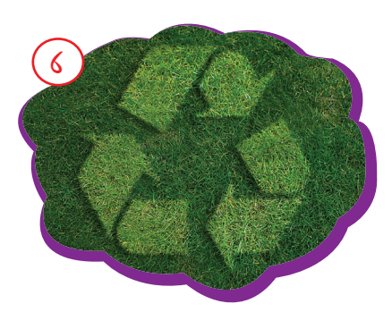
We should recycle.