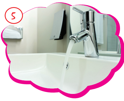
We shouldn't waste water.