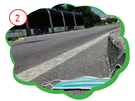
We shouldn't throw rubbish on the ground.