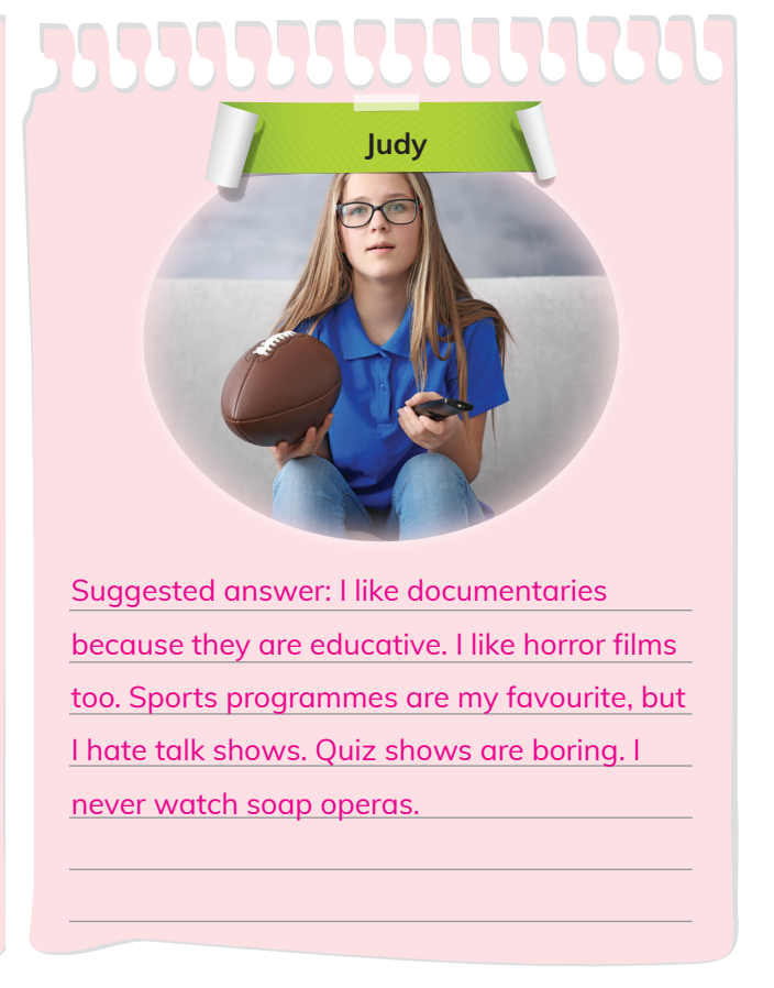
EXERCISE 2: Which of the following TV programmes Mikah and Judy can watch together and spend good time? Circle.

Suggested answer: I think documentaries are boring. I don't like horror films, but I like sport programmes because they are exciting. I sometimes watch talk shows. I think quiz shows are interesting and soap operas are melodramatic.