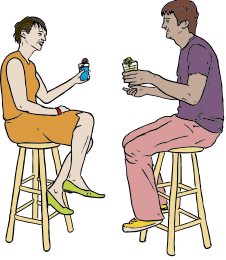
Meeting with friends